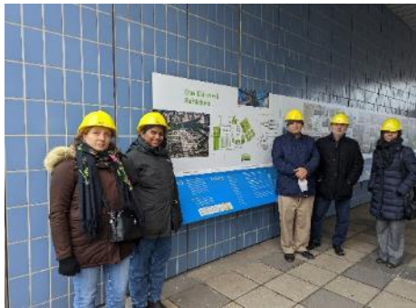
Sewage Treatment Facility, Ruhleben

As part of the capacity building activities, the guests visited the Berlin Water Works (Berliner Wasserbetriebe, BWB) Drinking Water Treatment Facility at Beelitzhof, and the Sewage Treatment Plant at Ruhleben. They also learnt about Berlin's Urban Water Cycle during the discussions with the Water Supply/ Water Management Division of BWB.