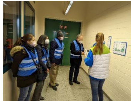
Drinking Water Treatment Facility, Beelitzhof