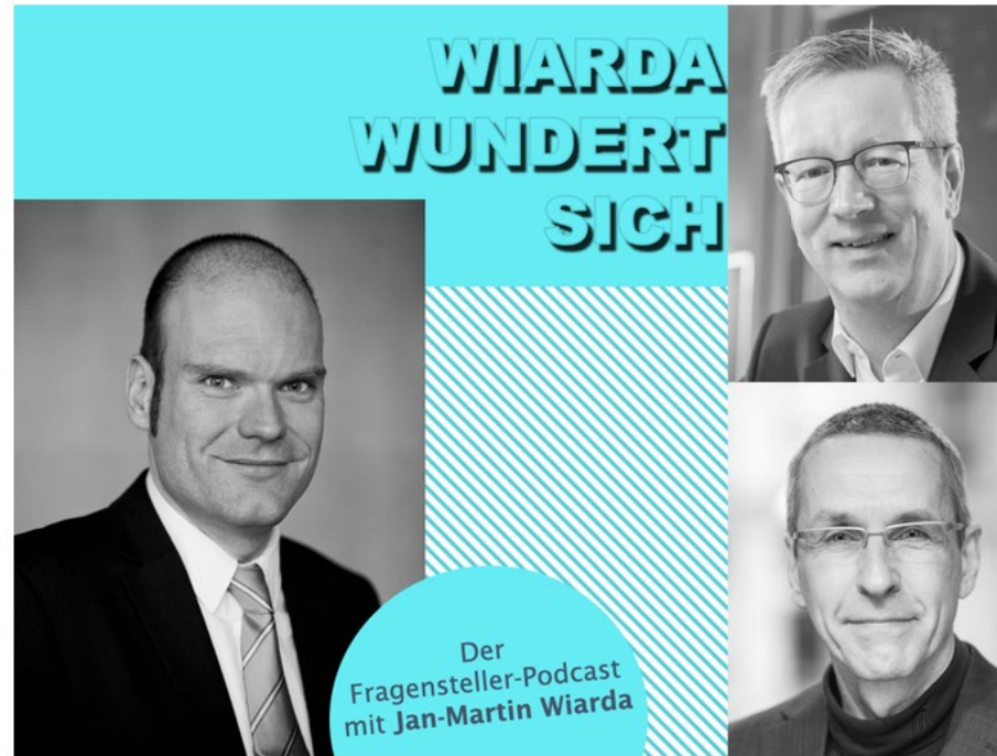
Der Fragensteller-Podcast mit Günter M. Ziegler (oben rechts) und Ulrich Dirnagl (unten rechts). Foto

Ein Streitgespräch-Podcast über DEAL, Elsevier und die Zukunft des wissenschaftlichen Publizierens – mit Günter M. Ziegler und Ulrich Dirnagl.